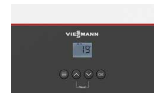
LCD screen with white backlight and 4 buttons

The heating water and DHW temperatures can be set quickly with the user friendly push-buttons. Operating states and temperatures are shown on the digital display screen.