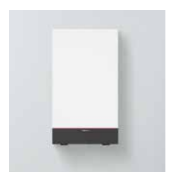
Vitodens 025-W (type BPKB)