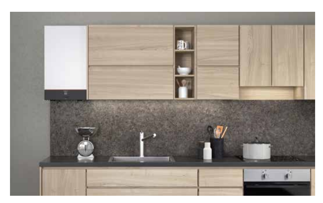
Vitodens 025-W featuring an attractive design in Vitopearlywhite

Compact and efficient wall mounted gas condensing boilers with a very attractive price/performance ratio